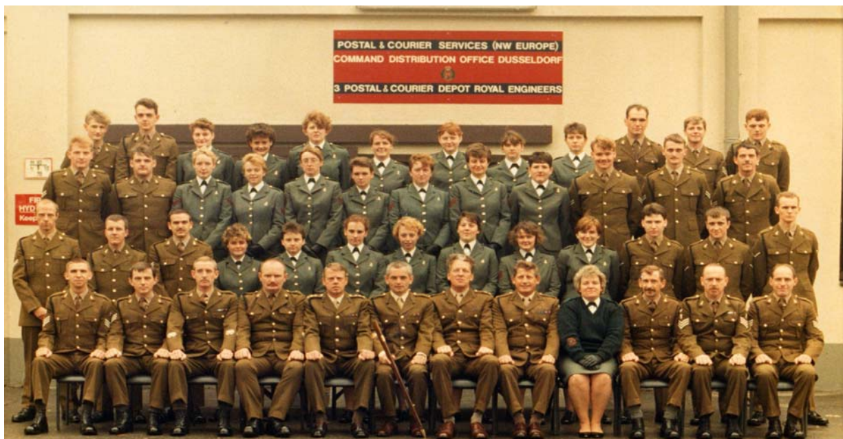
4. My Sqn at Dusseldorf 1989.