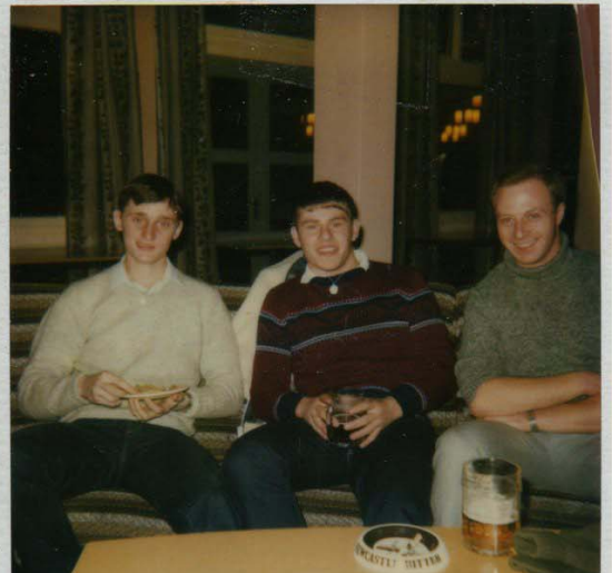
5. This is divided into four photos. Myself at Hanover 1984 as a despatch rider before we got Can Ams.